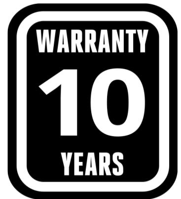
10 Year Warranty