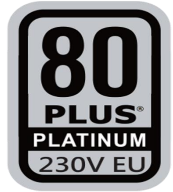
80 PLUS Platinum EU 230V Certified