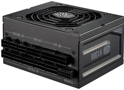
SFX Form Factor