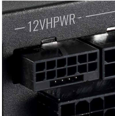
Fully support ATX3.0