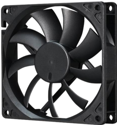
Quiet FDB Fan