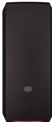
Front bottom LED