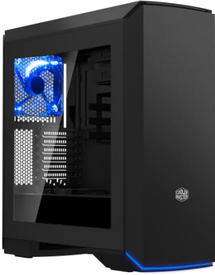
Blue Led fan and front bottom light