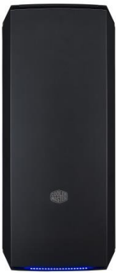
Front bottom LED