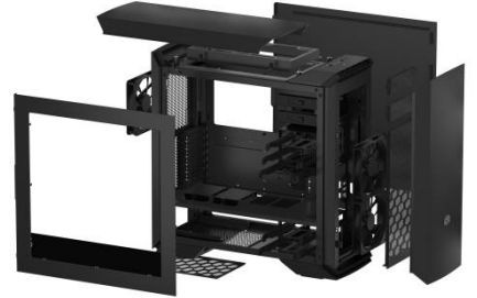
FreeForm Modular System: Customize, Adjust, Upgrade your case with our MasterAccessories