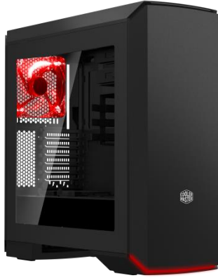
Red Led fan and front bottom light