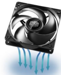
Quiet Silencio FP 135 fan