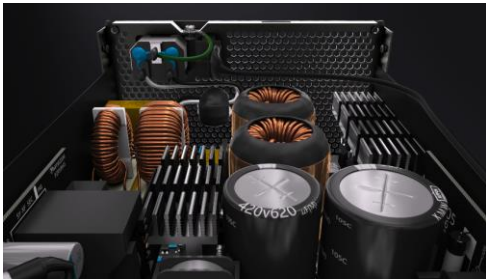
High Quality Japanese Components