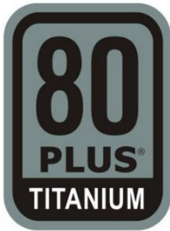
95% Titanium efficiency