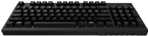
MasterKeys Pro L White Cherry MX Switch