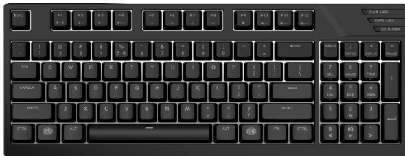
Brightest White LEDs